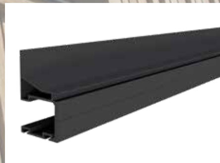
TefaFix ® F aluminium SC 9 coated