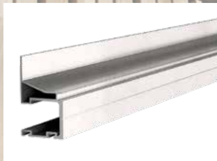
TefaFix ® F aluminium bright