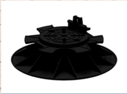
JustiFix® II JK 90 H