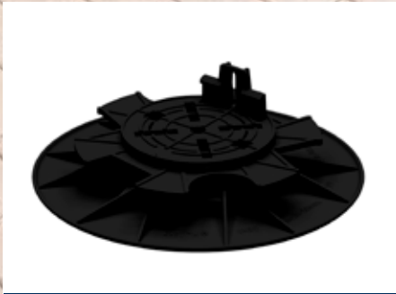
JustiFix® II JK 50 H