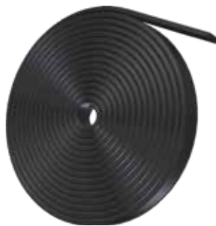
KompeFix ® II KF made from polyvinyl chloride